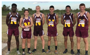
Pictured left to right:

Thank you so much for making the recent book fair one of our best ones yet! We had sales of over $2,800! The points we get from scholastic are based on the total sales. We are able to redeem these points and get some great things for our libraries and classrooms. Thank you again for always being so supportive of our school!